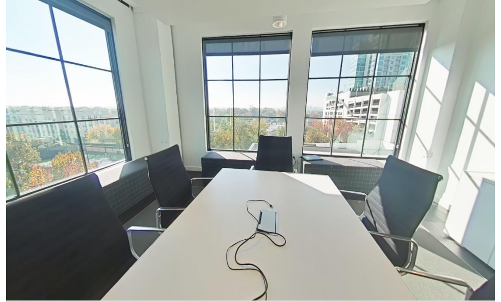
Main Conference Room