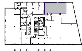
② Location Plan 1" = 100'-0"

Bill Ward 404.869.2655 bill@joelandgranot.com