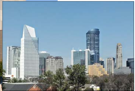
Rooftop View of Buckhead