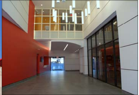
1st Floor Lobby