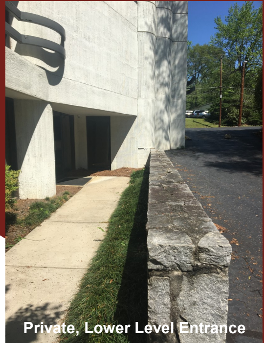
Private, Lower Level Entrance