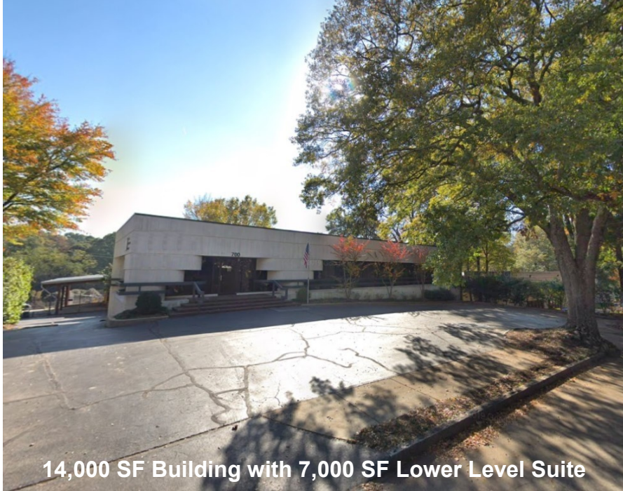
14,000 SF Building with 7,000 SF Lower Level Suite